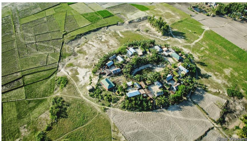
Figure: Gaibandha district

Two-dozen such plinth villages have now been built in the char districts, each costing about $50,000. The waters took two early examples, but the others flourish. The most impoverished families get first dibs to live on the plinths. When the waters rise, outlying families come up with their livestock to join them.